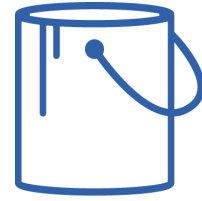
Metal Paint Cans (Less than 1" of dry paint left in the bottom of the can)