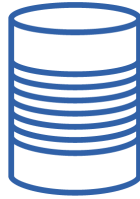
Tin Cans (No need to remove label)