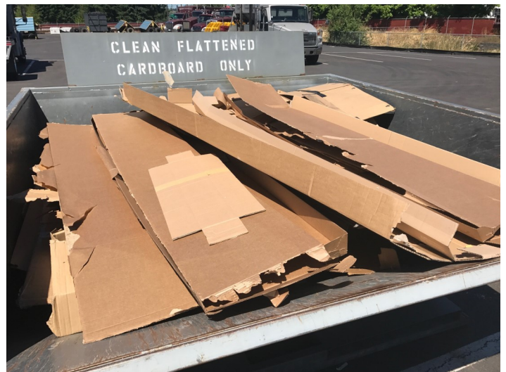
Recycle depot drop off